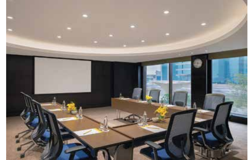
22, 26770 SQ.FT. MEETING ROOMS & CAPACITY