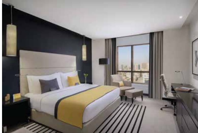
438 GUEST ROOMS