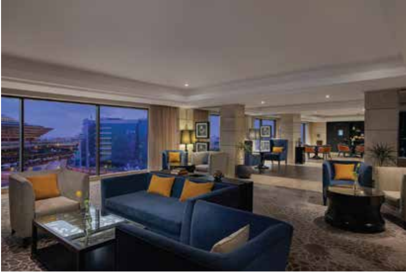
VOCO HOTEL RIYADH